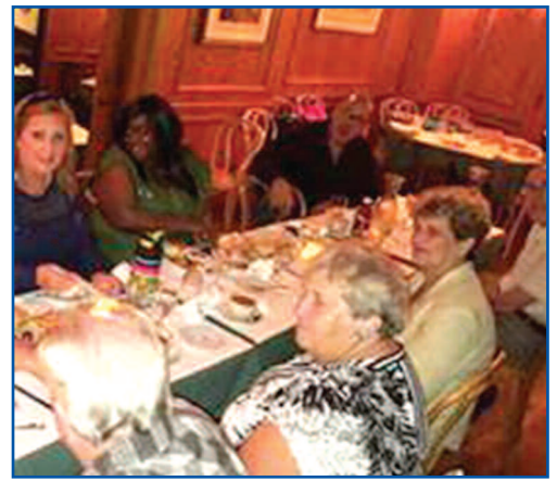
Astoria / LIC Installation