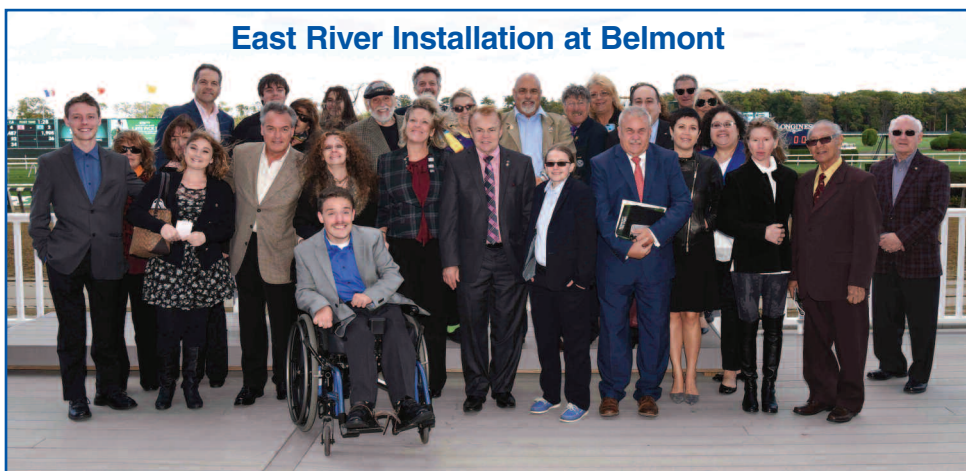
East River Installation at Belmont