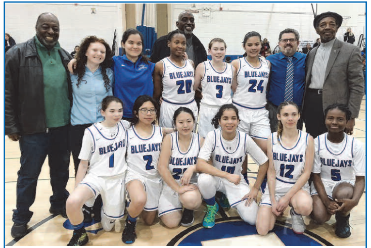
Lexington Blue Jays