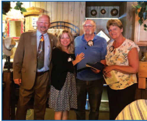
Glendale member installations